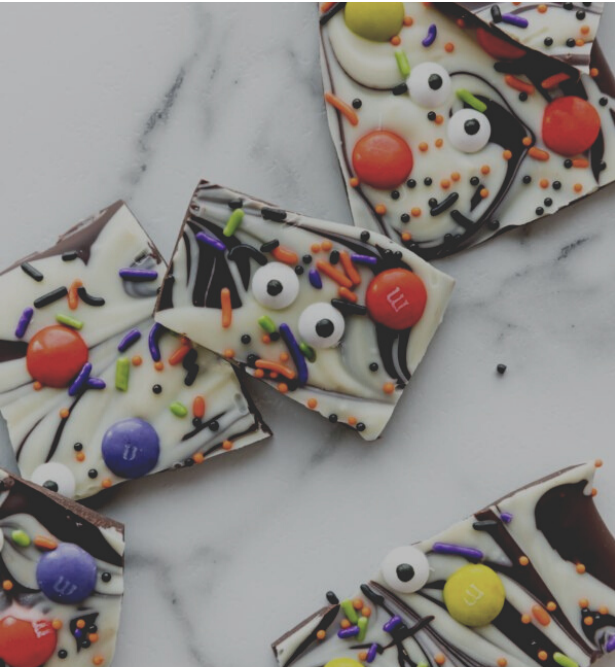
As seen on Sally's Baking Addiction